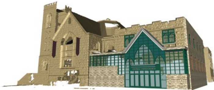
new west entrance