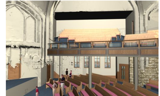
interior view of south sanctuary