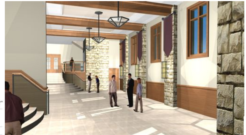
interior view of street-level foyer looking east