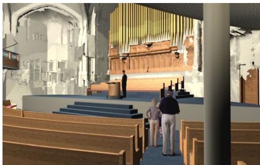
view toward sanctuary stage